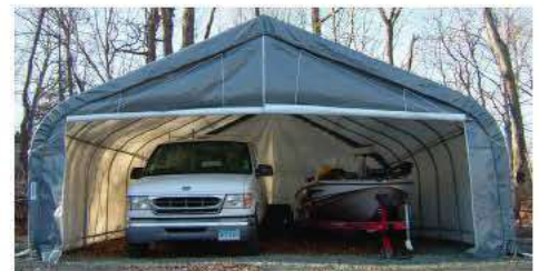
Two Car Garages