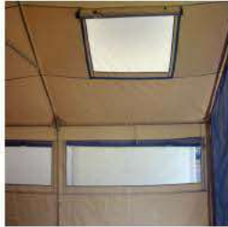
Roll Up Velcro Windows