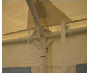
All frame members are long life Structural Steel