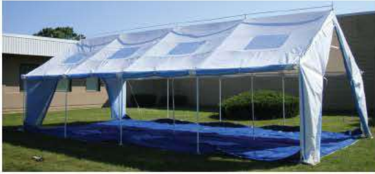
Sides Can Roll Up To Create A Canopy Or Medical Facility