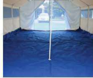
Rubber-Backed Fabric Floor Kit Included