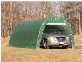
One Car Garages