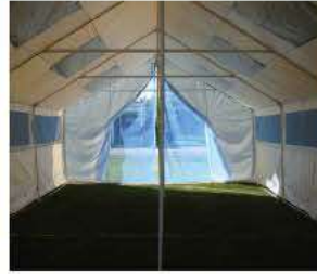
Removable Center Structural Support