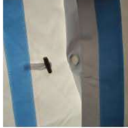
Includes Door Hold-Ups