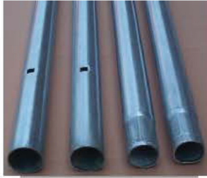
All frame members are long life galvanized steel