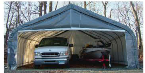
Two Car Garages