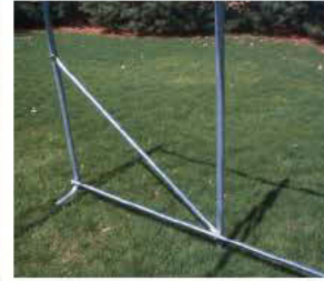
Structural wind brace on each side