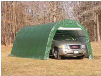
One Car Garages