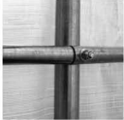
Pre-Drilled, Bolt together frame