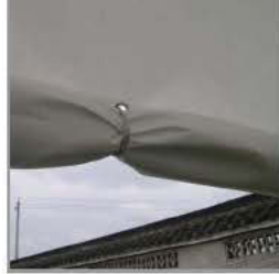
Door Hold-Up Bungee Cords