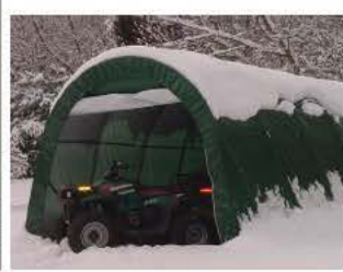
Withstands winter weather