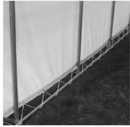
Heavy-Duty Cover lacing