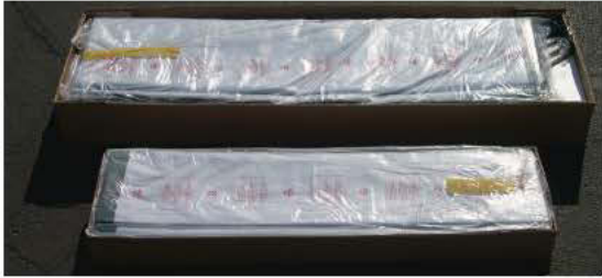
Consumer friendly packaging - Easy to handle 2 box shipment