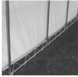
Heavy-Duty Cover lacing