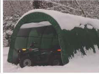
Withstands winter weather