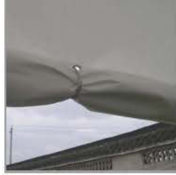
Roll-Up Door Kit