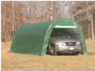
One Car Garages