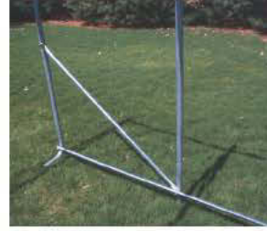
Structural wind brace on each corner