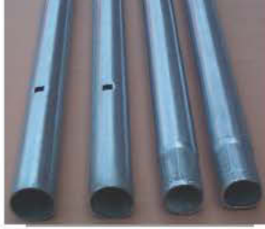
All frame members are long life galvanized steel