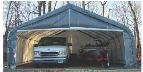
Two Car Garages