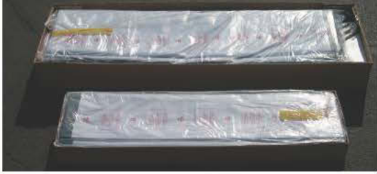
Consumer friendly packaging - Easy to handle 6 box shipment