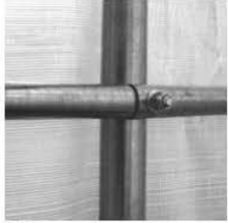
Pre-Drilled, Bolt together frame